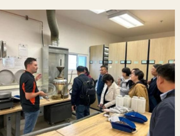
Visiting the State Grain Lab with a Trade Team from China, hosted by the USADPLC